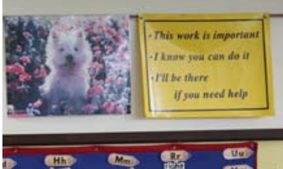
and behavioral goals (see the kernorcement strategy brief for more details).

of bribery (Brophy, 1998). While this is often a valid concern, the careful design of behavior plans to slowly shift from artificial rewards to natural rewards in the environment can help prevent this reversal from happening. Extrinsic motivation can assist students to build skills and obtain knowledge or information that triggers intrinsic motivation to continue the learning process. In addition, extrinsic incentives may be particularly effective for students with emotional, behavioral, or attention needs that may require additional supports to meet academic